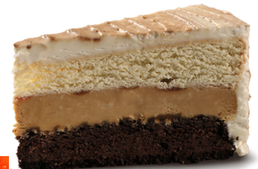
Iced Coffee Cake

ICED COFFEE CAKE $8.49 TURTLE CHEESECAKE $8.49 COOKIES & CREAM CAKE $8.49 VANILLA ICE CREAM $4.99 Chocolate, strawberry, or caramel topping