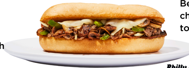
Philly Cheesesteak Sandwich

Yo, Adrian... I made you a sandwich! Beef or chicken topped with onions, mushrooms, green peppers, and provolone cheese and served on a hoagie roll. $22.49