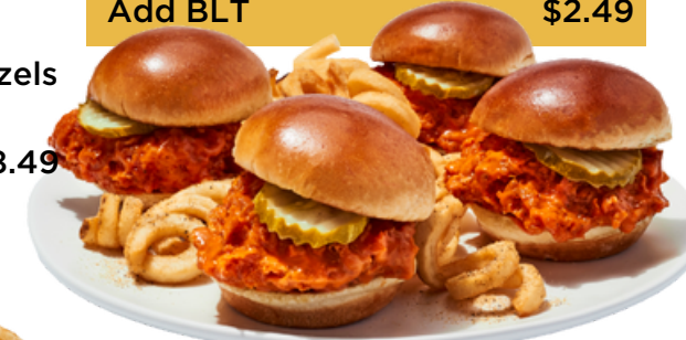
Buffalo Chicken Sliders

Ground Beef $19.99 Buffalo Chicken $21.99 Two Of Each $20.99 Add BLT $2.49