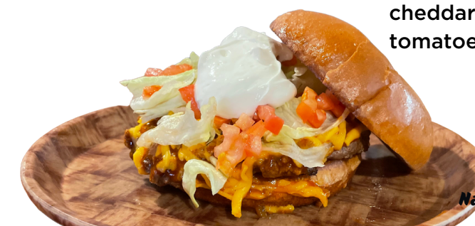
Nacho Ordinary Burger

We grill our double-sized chicken breast and coat it with Daytona Beach sauce, then top it in bacon, cheddar, cheese, and diced tomatoes. $26.49