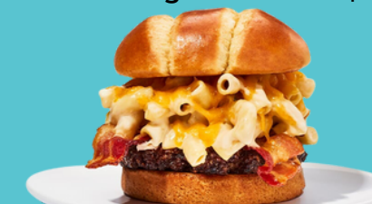
Bacon Mac N' Cheese Burger

A "chip" off the old block. Everything you love about nachos in burger form! $18.99