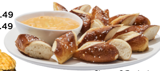
Cheese & Pretzels