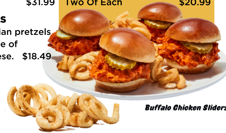
Buffalo Chicken Sliders

Ground Beef $19.99 Buffalo Chicken $21.99 Two Of Each $20.99