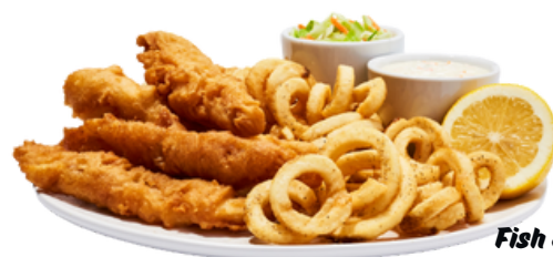
Fish & Chips

Fresh steamed shrimp with lemon for squeezin', cocktail sauce, and butter. Get peelin'. 1/2 pound $18.99 Full pound $36.49